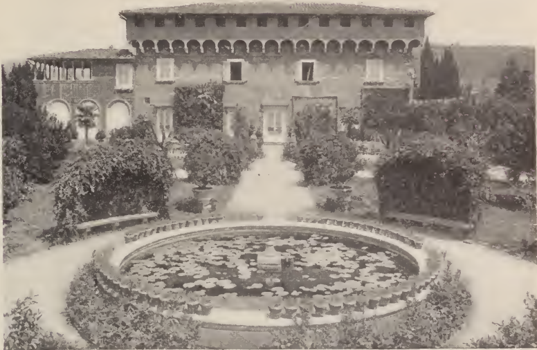
COREGGI, THE VILLA WHERE LORENZO DIED.